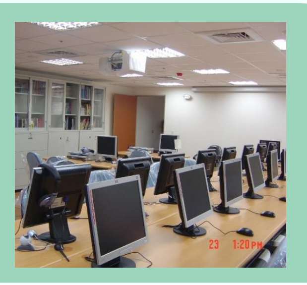
Center of Multimedia Material Design and Foreign Language Instruction