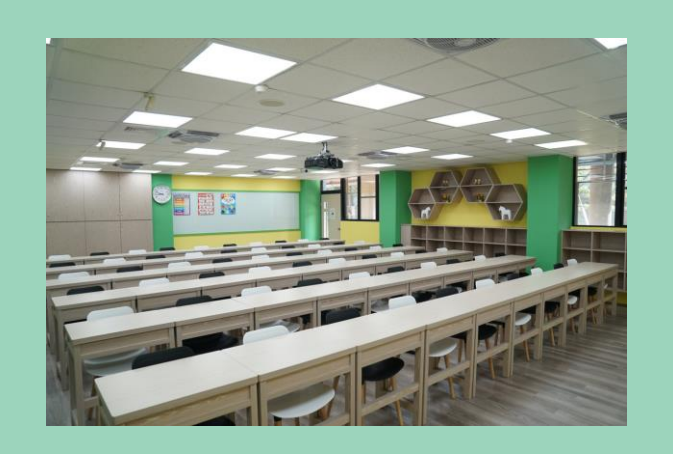
English Teaching Lab