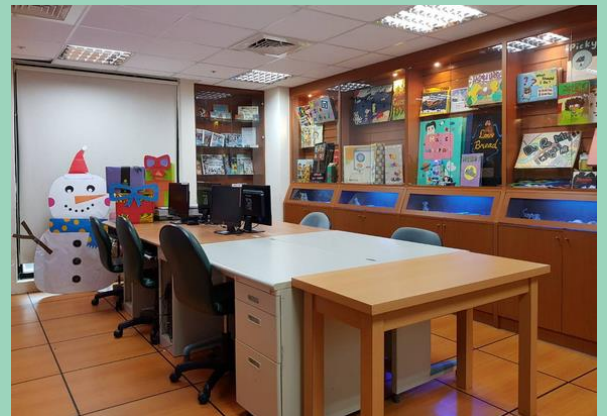
Materials production area