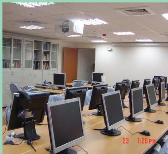
Center of Multimedia Material Design and Foreign Language Instruction